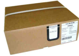
Tough and user-friendly packaging