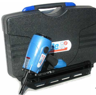
Tool case included.