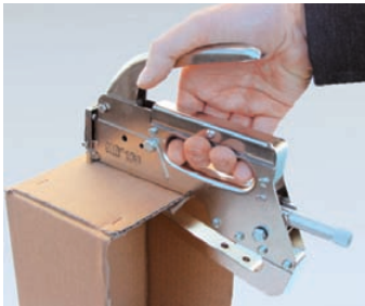
Lid: flap stapled inside. Fill.