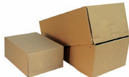
Staple together bottom and lid.

DS 75 Spiral hose, max. length 7.5 m B 2/4 Balancer up to 4 kg weight, rope-length up to 2 m. Swivel arm systems for wall and table installations are available (see page 7)