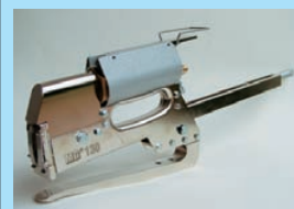
130/1916 PUX with extended magazine for 250 MG° staples.

Pneumatic stapling pliers are also available with a reversed trigger so that stapling is possible with the throat pointing downwards.