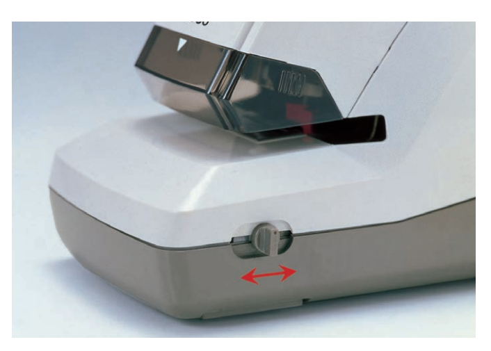
STRIKE POINT The stapling depth is easily adjusted.