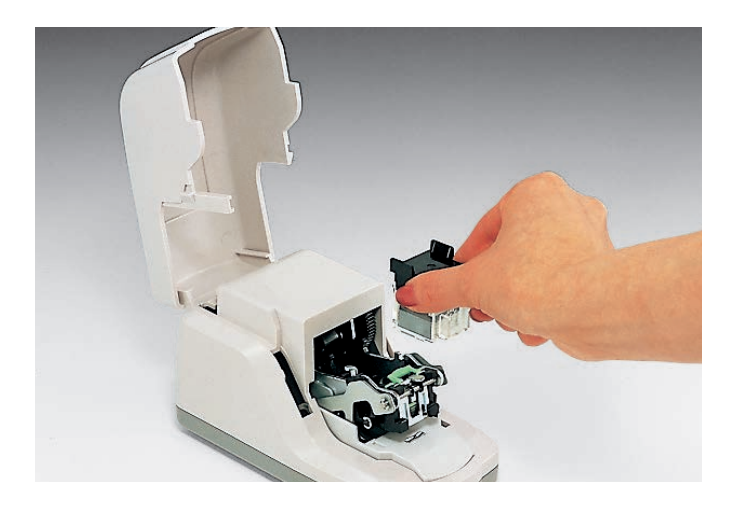
HINGED COVER The electronically secured cover can be opened safely for exchanging the flat staples cartridge.