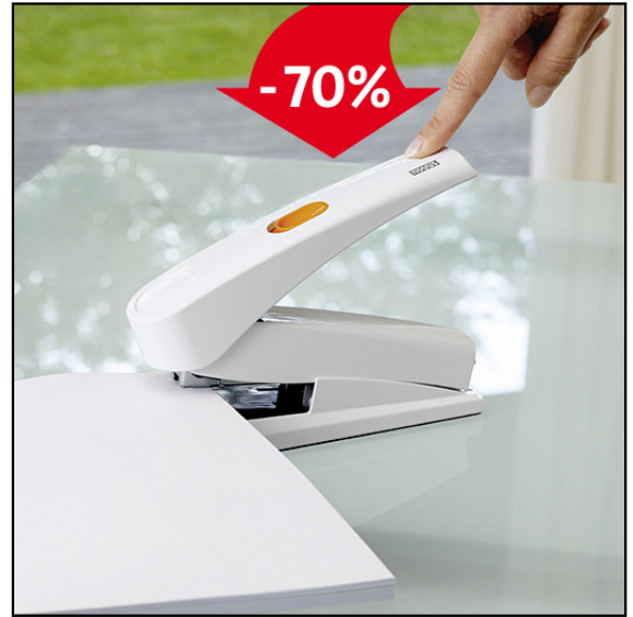
Stapling with Power on Demand: Lever raised for super-easy stapling - saves over 70% of the effort.