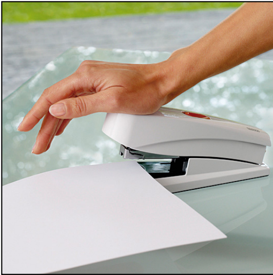
Stapling with lever folded down without using Power on Demand - like a conventional stapler.