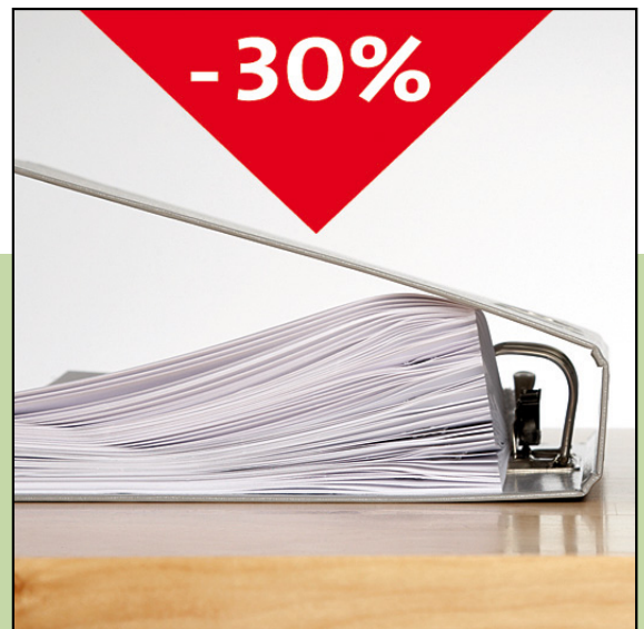
With stapling legs resting flat against the paper, flat-clinch stapling cuts filling space by as much as 30%. Despite Novus flat-clinch stapling, staples are easily removed from paper with a staple remover.